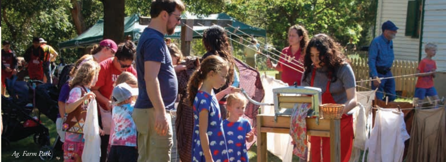
Ag. Farm Park