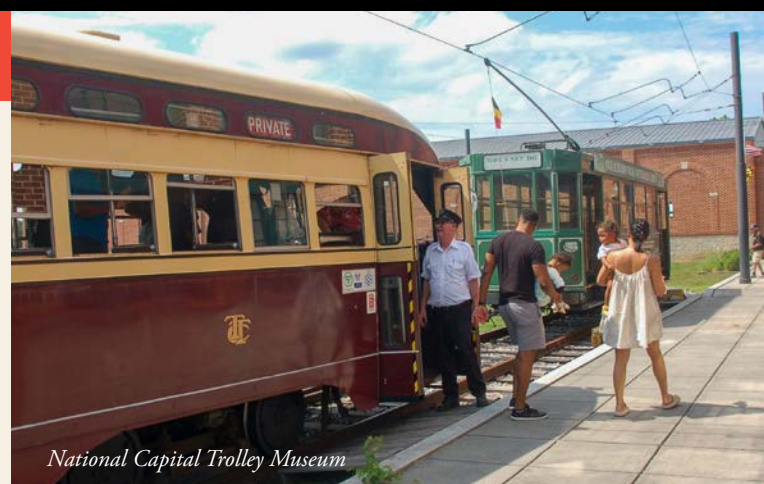
National Capital Trolley Museum

HERITAGE DAYS 2025 JUNE 28 & 29 • 12 to 4 P.M.