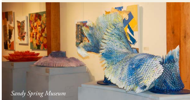
Sandy Spring Museum