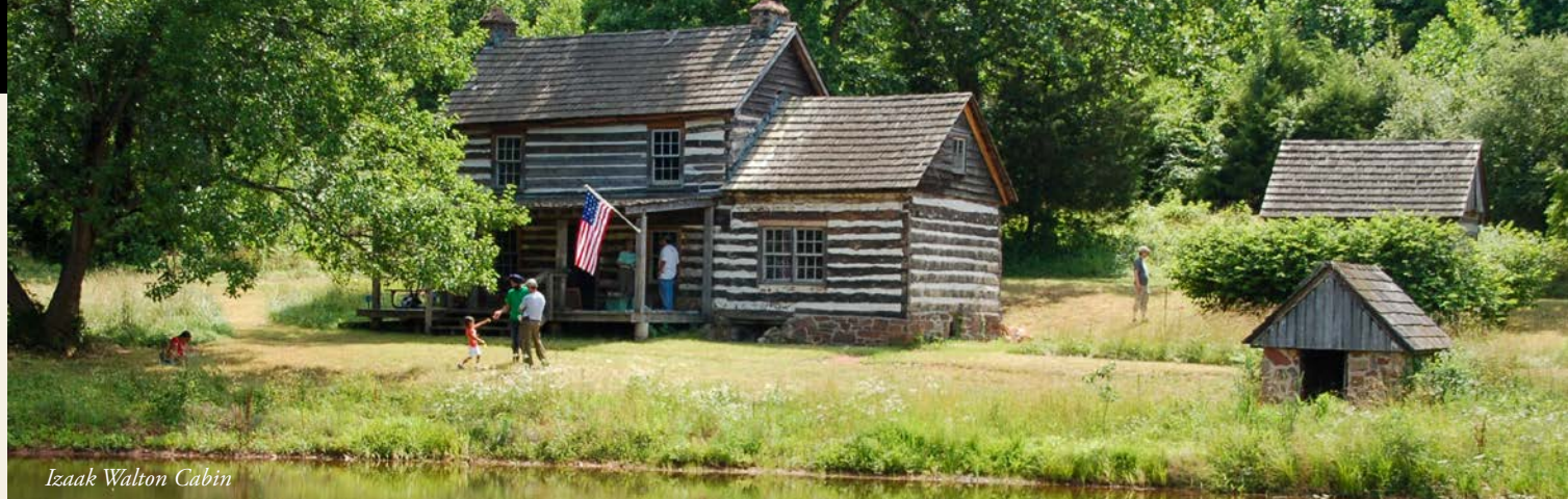
Izaak Walton Cabin