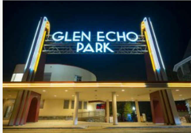
Glen Echo Park