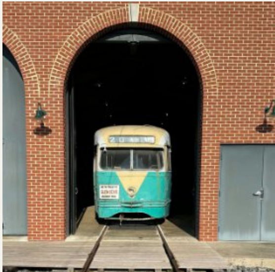
National Capital Trolley Museum