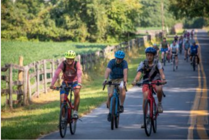
Countryside Alliance Ride the Reserve