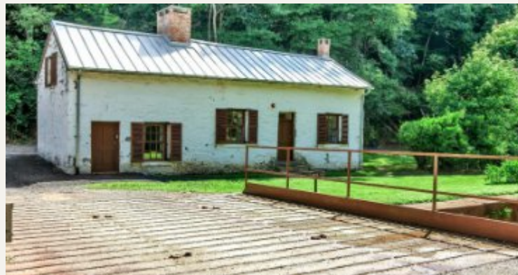
Canal Quarters Swain's Lockhouse