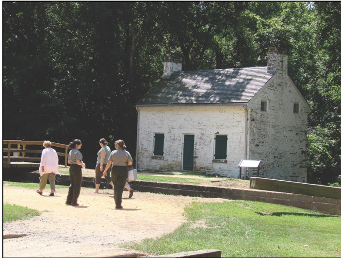
Edward's Ferry Lockhouse