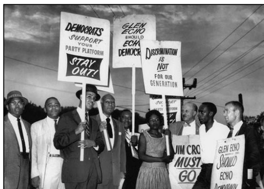
Glen Echo protestors