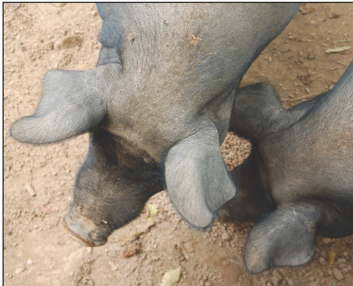
Heritage breed pigs

THEME: Slave plantation life during the 1850s and the heroic story of the Underground Railroad