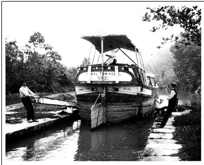
Barge on canal

Small villages often sprang up at the river. At Edwards there was a ferry which ran across the river to Virginia, a general store, a granary, and assorted outbuildings.