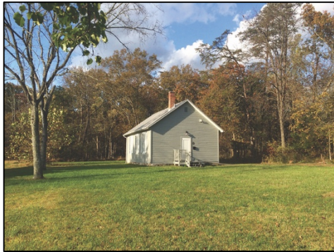
Boyds Negro School