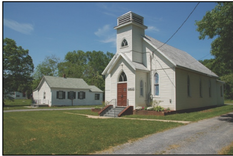
Warren Historical site