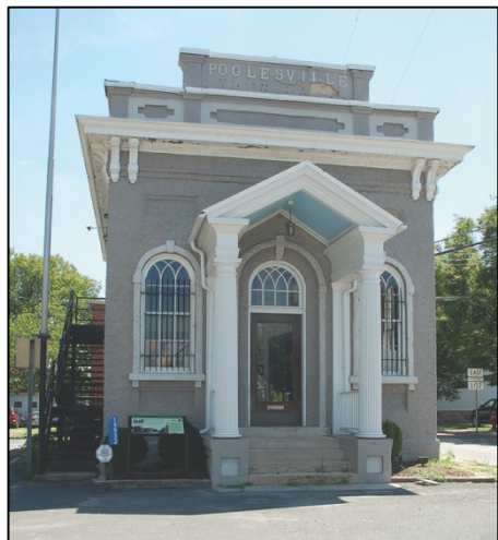
Historic bank building