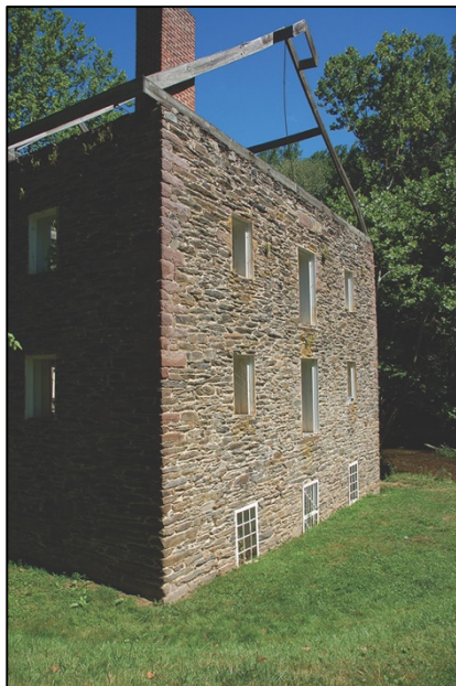
Black Rock Mill

Josiah Henson an enslaved Montgomery County man and later as a free man the founder of the Dawn community in Canada