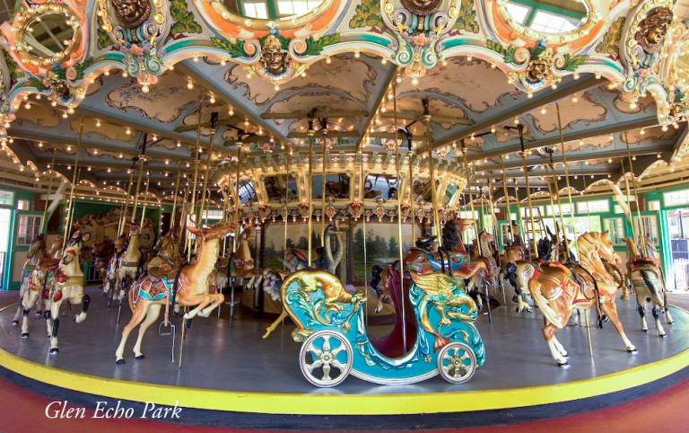
Glen Echo Park