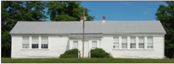
PLEASANT VIEW SCHOOL