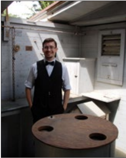
GAITHERSBURG LATITUDE OBSERVATORY