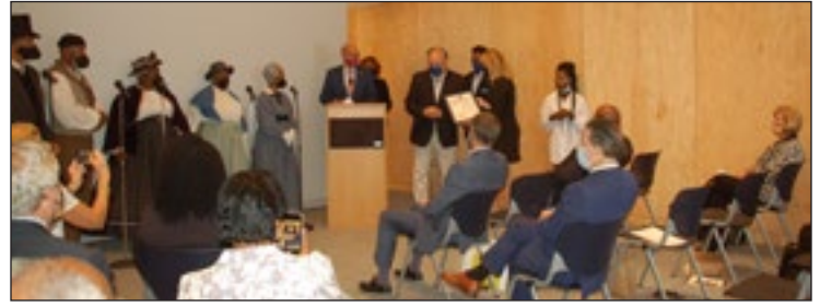
UNDERGROUND RAILROAD MONTH KICK-OFF

Heritage Montgomery was able to secure $454,000 in MHAA funding for county partners. When combined with match and leverage that total value is over $1 million.