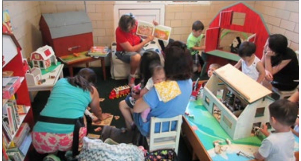
HERITAGE DAYS AT THE MOOSEUM