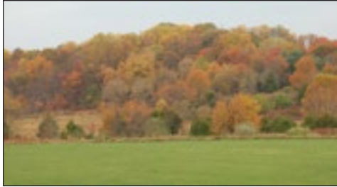
FALL IN THE HERITAGE AREA