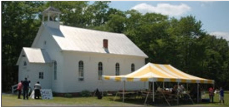
ST. PAUL CHURCH AT SUGARLAND

Our heritage area has been a leader in Maryland's efforts to preserve and share our rich African American history. Below are updates on four historic local church community projects: Pleasant View, Sugarland, Scotland, and the Warren Historic Site. Heritage Montgomery and the Maryland Heritage Area Authority have awarded grants of over $500,000 to these important projects and HM has provided direction and assistance in securing additional State and county funding of over $600,000. A big thank you to all of our elected officials for their support!