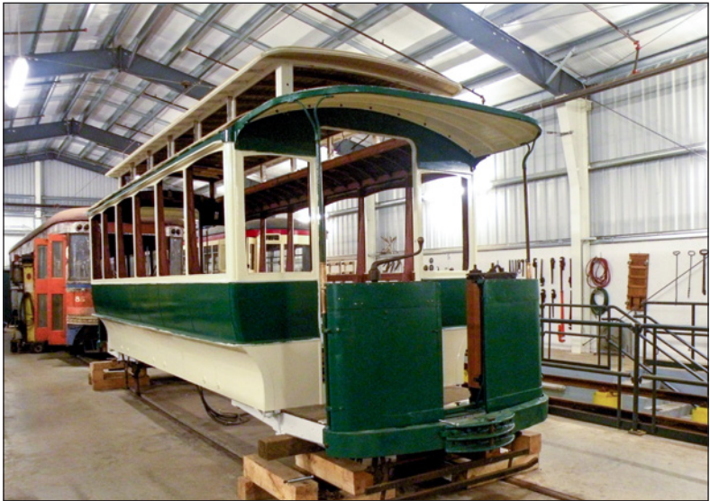
TROLLEY CAR RESTORATION

12535 Milestone Manor Lane Germantown, MD 20876 301-515-0753 • HeritageMontgomery.org