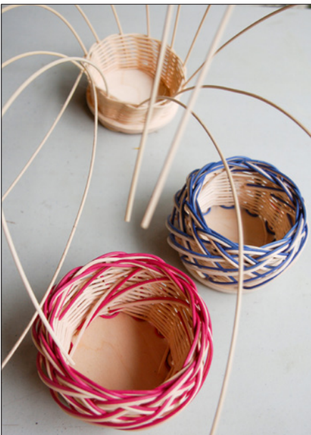
HANDWOVEN BASKET DEMONSTRATION

Roads found throughout the county. These beautiful, unspoiled historic roads lead through rolling farm country, woodlands, and villages. The roads are a great way to explore local history, flora, and fauna while offering stops at area orchards, farm markets, parks, and heritage sites. Plan a trip now at montgomeryplanning.org/rusticroads .