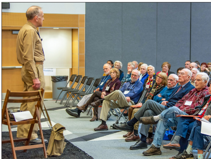
LECTURE AT HISTORY CONFERENCE

The beginning of 2020 featured two of Heritage Montgomery's favorite annual sponsorship events: the Montgomery County History Conference and Montgomery County History Day produced by Montgomery History and the Montgomery County Public Schools, respectively.