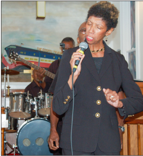
GOSPEL SINGER AT WARREN