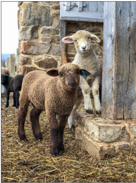
LAMBS AT SHEPHERD'S HEY