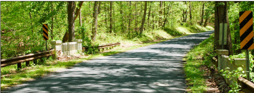
BRIDGE ON MARTINSBURG ROAD

The class carried on during the shutdown, meeting virtually with site representatives and several subject-matter experts as well as cataloging existing source materials. We hope to host the group at the site this summer so they can meet the people and see the buildings associated with this great project.