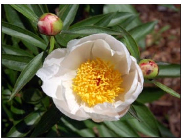
A spring bloom at the Schwartz Peony Garden in Seneca Creek State Park.

s we approach year's end, we would like to ask that you remember Heritage Montgomery in your year-end giving. Because we are not a membership organization, our annual (and only) fundraising appeal is of critical importance and has a significant impact on HM's efforts to support and promote Montgomery County's unique history, culture, and nature.