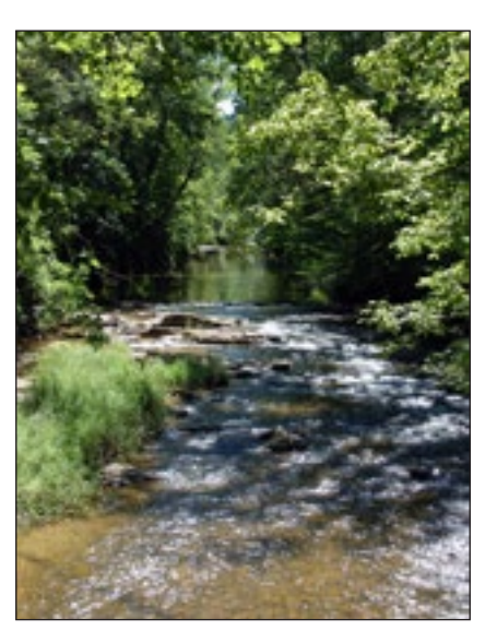
SENECA CREEK STATE PARK

In June, HM submitted a proposal to the Maryland Heritage Areas Authority (MHAA) amending the heritage area's boundaries. This amendment addressed the fact that a number of important sites thematically and physically linked to Heritage Montgomery had been omitted from the 2002 Management Plan and were therefore ineligible to apply for MHAA capital and project grants. The first of these omissions was remedied in 2013 when HM's boundaries were amended to include Rockville and its heritage assets.