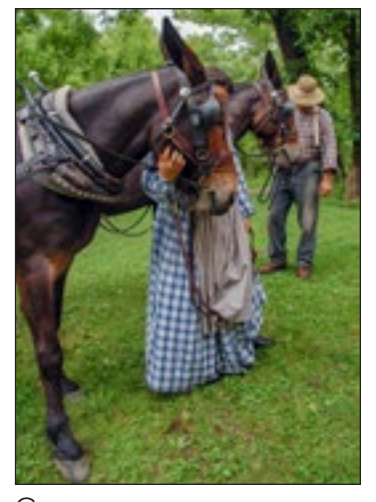
Canal mules and skinners at Edward's Ferry.

e were delighted to see great turnouts for Heritage Days events at sites all across the county. The incredibly wide variety of programs and activities offered this hear guaranteed that there really was something for everyone!