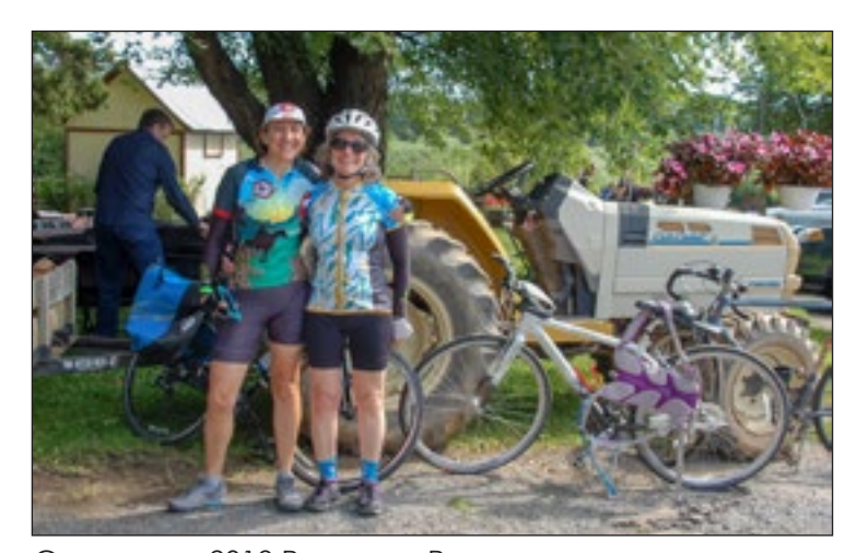
CYCLISTS AT THE 2018 RIDE FOR THE RESERVE.