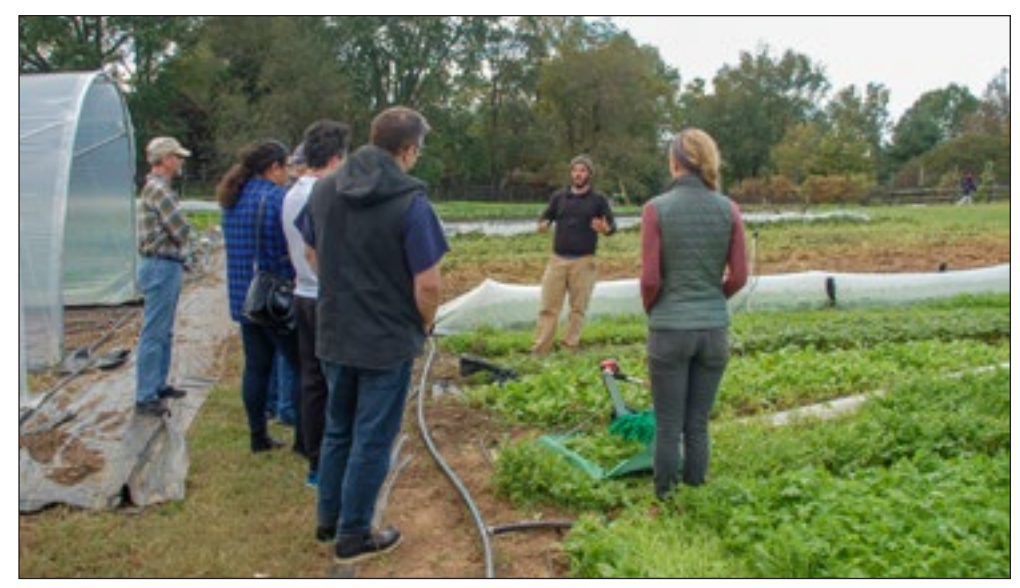
COMMON ROOT FARM TOUR IN DERWOOD.

GET OUT AND ENJOY A LECTURE THIS WINTER. SEE THE CALENDAR ON OUR WEBSITE FOR A SELECTION OF LECTURE SERIES OFFERED BY PARTNERS INCLUDING PEERLESS ROCKVILLE, MONTGOMERY HISTORY, SILVER SPRING AND GERMANTOWN HISTORICAL SOCIETIES, SANDY SPRING SLAVE MUSEUM, SANDY SPRING MUSEUM, AND MONTGOMERY COLLEGE.