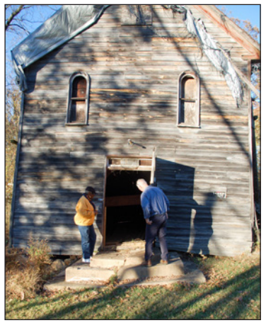
LOVING CHARITY HALL