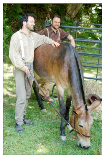
CANAL PONY MULE

walking tours of the Germantown Historic District, a railroad town dating to the 1880s. And it is always fun to check out all of the model trains and transportation exhibits at the historic Silver Spring B&O Railroad Station; this year a bike/picnic tour of historic Silver Spring that left from the station was a fun way to spend Sunday morning.