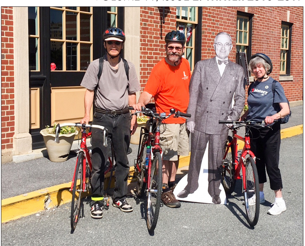
HERITAGE DAYS CYCLISTS, PHOTO COURTESY OF SILVER SPRING HISTORICAL SOCIETY

One of the exhibits in the new National Museum of African American History and Culture in Washington, DC is "Defending Freedom, Defining Freedom: The Era of Segregation," featuring the Jones-Hall-Sims House. Also referred to as "Freedom House," this 2-story log structure was built circa 1875 by Richard Jones, a former slave, in the historic Jonesville community that is now part of Poolesville. Disassembled and cataloged log by log before being rebuilt in the museum, it is a rare surviving example of post-Emancipation homes that were constructed in newly established free black communities across the country.