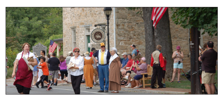
Brookeville street scene

Discussions are underway to develop a Brookeville Walking Tour linking the town's Quaker and African American history with nearby sites, including M-NCPPC parks and trails. A strong association between the historic locations in and around the town of Brookeville and Montgomery Parks' new Woodlawn Visitor Center will add depth to the rich Quaker and African American heritage stories in the Brookeville/Sandy Spring area and offer visitors an expanded means of exploring this aspect of local history.