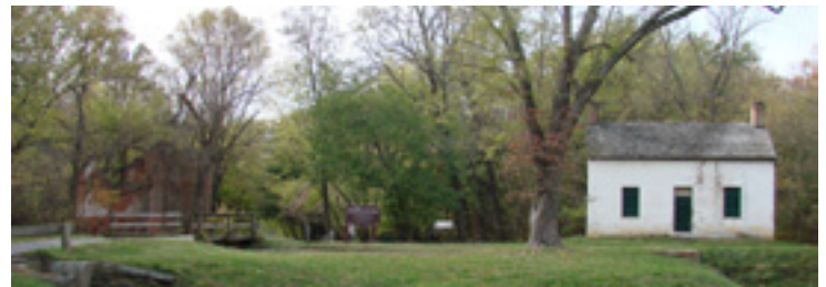
Edwards Ferry Lockhouse

A unique opportunity to enhance the heritage area’s visitor experience is now available through the Canal Quarters interpretive program. Visitors are invited to experience a taste of life along the canal by staying in a historic lockhouse for a day and night, with three lockhouses currently open. Renovation is underway at Lockhouse 25 at Edward’s Ferry and the Park Service has submitted an MHAA capital grant