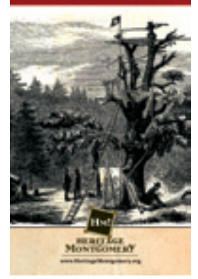
Civil War brochure

In the waning days of 2010, Heritage Montgomery is once again reaching out to our friends, asking for their generous financial support for the many important projects and programs planned in the coming year. As Civil War Sesquicentennial commemoration activities begin in earnest, we hope to take advantage of this significant event to spread the word about the fascinating historic sites and programs we have to offer in Montgomery County. Many of these are featured in a new brochure guide to Civil War stories in our area. We hope you will plan to attend the premiere of our Life in a War Zone video in March 2011 and join us for live Civil War musical and dramatic performances later in the year. We plan on re-tooling our 14th annual Heritage Days celebration a bit, adding a new twist or two to the already fun-filled weekend.