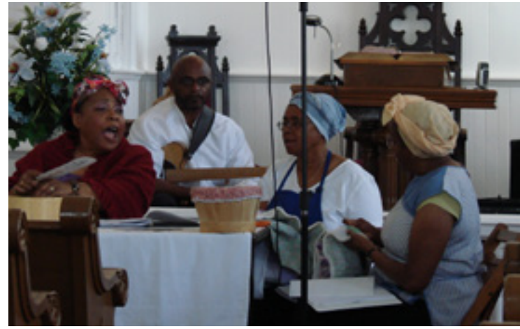
"Spiritual Harmony" at St. Paul Community Church