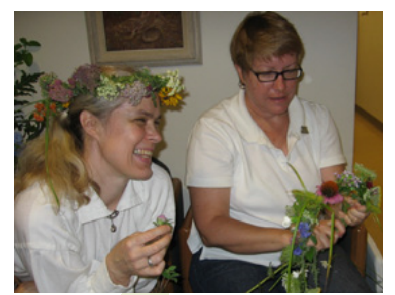
Making traditional floral wreaths at the American Latvian Museum

On June 22 Heritage Montgomery was the recipient of a Montgomery County Council Proclamation in recognition of Heritage Days Weekend and Heritage Montgomery's years of service to the residents of the county.