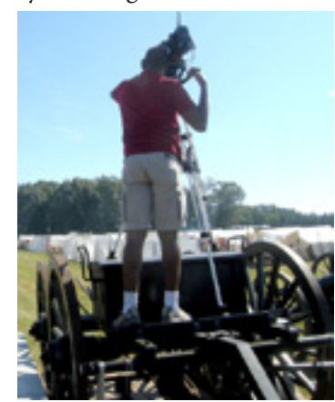
Film crew at work

We are also excited about several companion pieces to the video. A beautiful 32-page booklet, "Life in a War Zone: A Guide to the Civil War in Montgomery County, Maryland, 1861-1865," highlights individual communities and their stories from the war years. HM is also working on an attractive