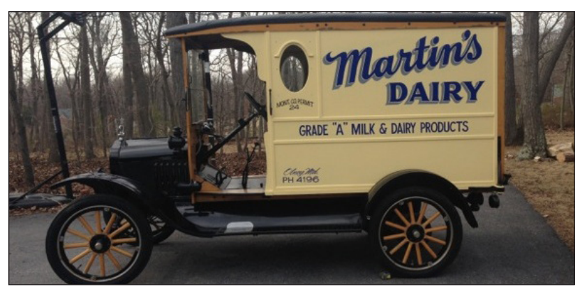
MOOSEUM MODEL T MILK DELIVERY TRUCK

Each year, Heritage Montgomery awards Mini Grants of up to $2,500 each to local non-profit organizations and government entities. These grants help fund heritage programs and products throughout the county. HM is pleased to award FY 2016 Mini Grants to: