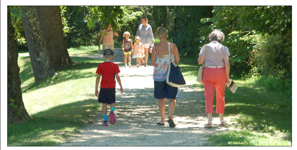
C&O CANAL TRAIL WALKERS