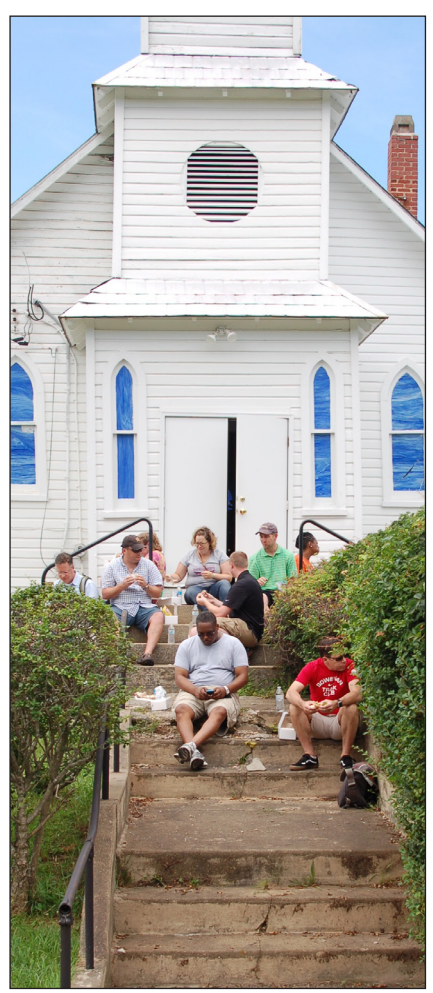
TEACHERS AT PLEASANT VIEW HISTORIC SITE

aryland's Six-to-Fix is a new program developed by Preservation Maryland to help save threatened resources across the State. "Rather than creating lists of threatened buildings we're [Preservation Maryland] ready to do something about it."