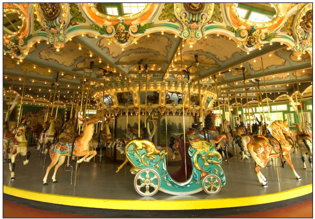
GLEN ECHO CAROUSEL

Heritage Montgomery Management Grant - $100,000