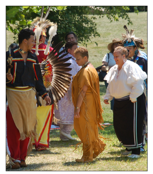
AS PART OF HERITAGE DAYS, SUGARLOAF REGIONAL TRAILS' NEW NATIVE AMERICAN HERITAGE TRAIL WAS DEDICATED AT MONOCACY AQUEDUCT. FUNDED IN PART BY HERITAGE MONTGOMERY, THE TRAIL IS THE FIRST IN THE COUNTY TO FEATURE AMERICAN INDIAN HERITAGE. MEMBERS OF THE PISCATAWAY CONCY TRIBE PERFORMED TRADITIONAL DANCES AND SHARED THEIR CUSTOMS AND TRADITIONS WITH A CROWD OF OVER 200. WE ARE LOOKING FORWARD TO HERITAGE DAYS 2016 WHEN THE PISCATAWAY CONCY TRIBE WILL RETURN FOR THE GRAND OPENING OF SRT'S NATIVE AMERICAN HERITAGE TRAIL!