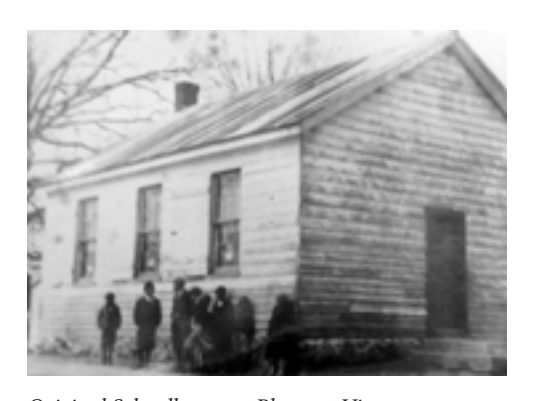
Original Schoolhouse at Pleasant View

We are very excited about this special project and look forward to premiering the film during Black History Month in February 2014.