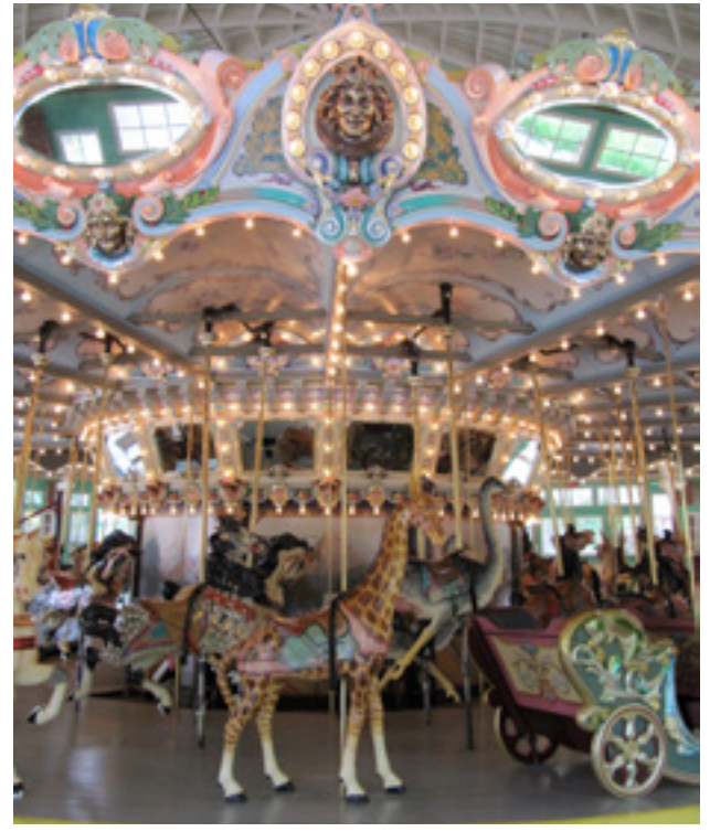
Glen Echo Carousel

- $625 : To revise and reprint the Warren Historic Site brochure