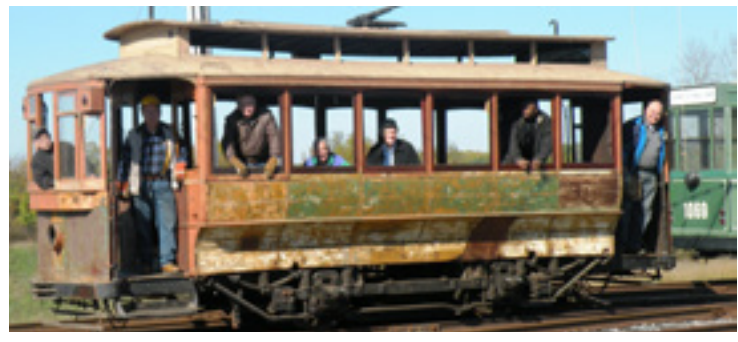
National Capital Trolley Museum

Heritage Montgomery Management Grant - $100,000