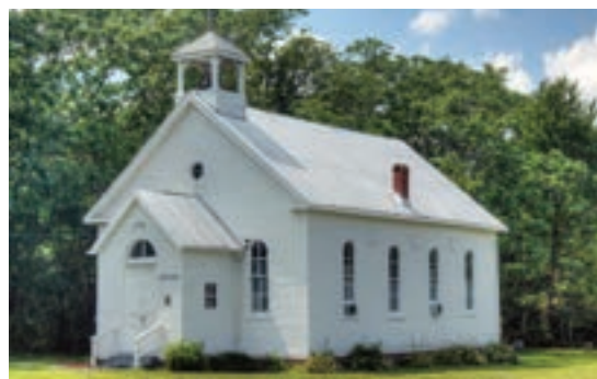
Sugarland Forest/St. Paul Community Church

Heritage Montgomery is very excited about its latest product: Community Cornerstones: A Selection of Historic African American Churches in Montgomery County, Maryland. This 34-page brochure features the stories of 24 unique historic churches and their communities.