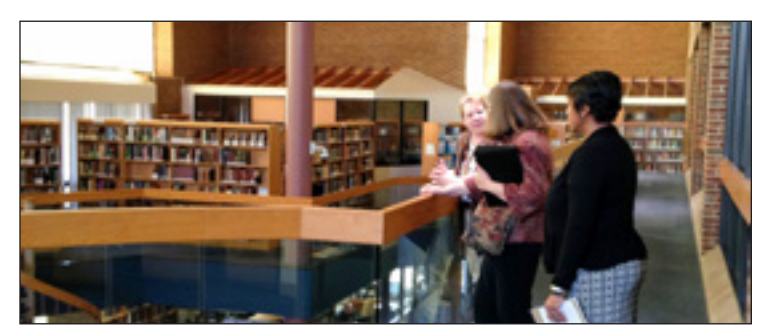
MARYLAND STATE ARCHIVES

Work continues on our project to protect the historic documents of local African American church communities. HM will partner with the Maryland State Archives (MSA) using their staff and equipment to help catalog, digitize, and stabilize records collected from the Pleasant View Historic Site. MSA staff will supervise our Montgomery College intern who will work at the Archives. The original records along with a digitized copy will be returned to Pleasant View, and MSA will retain a copy for their collection. Montgomery County Historic Preservation Grant funding has made this important project possible.