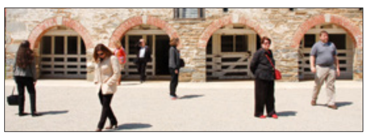
WOODLAWN VISITOR CENTER

For details about Heritage Days 2016, visit our new website, HeritageMontgomery.org or call 301-515-0753 and we'll be happy to send you a brochure.