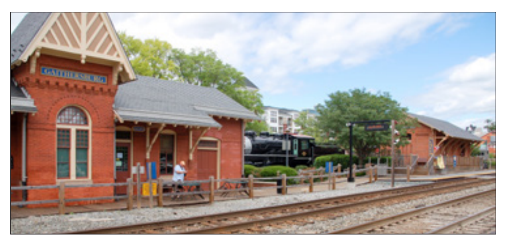
Gaithersburg Community Museum and Historic Train Station

August 25th marks the 100th anniversary of the National Park Service! The centennial offers the perfect opportunity to explore Montgomery County's C&O Canal National Historical Park. From the Great Falls Visitor Center in Potomac to historic lockhouses on the way out to Poolesville, you'll find a wealth of options to enjoy both the history and natural beauty of our own national park! Special activities are planned at parks throughout the country to celebrate these national treasures.