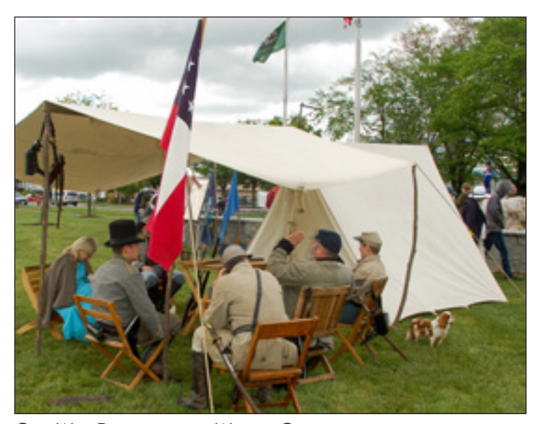
CIVIL WAR REENACTORS ON WHALEN COMMONS

eritage Montgomery would like to thank all of our donors for their generous contributions to our efforts supporting and promoting the heritage area. Thanks to your donations, HM can help fund important local projects with Mini Grants as well as support wonderful community programs like Poolesville History Day, pictured below.