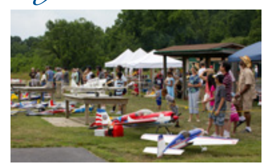
DC Radio Control Club

The weekend of June 23rd and 24th will mark the 15th annual Heritage Days Weekend! This is a wonderful opportunity to explore our rich history at over 35 sites around Montgomery County, all open for FREE! As always, we'll focus on making a visit to our many unique heritage sites interesting —and fun—for