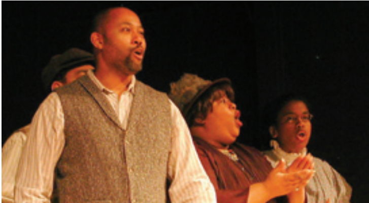
Glorious voices of the Washington Revels

The collaboration between Heritage Montgomery and the Washington Revels continues to thrive! The Revels are busy at work developing two historic personas to help tell the story of Montgomery County's rich Civil War and Underground Railroad history. Look for these characters at various Heritage Days sites and at special events throughout the year!