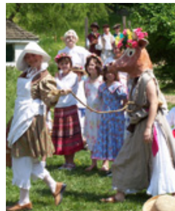
Washington Revels “Betsy the Cow”

As always, many sites will feature musical performances, children’s activities, refreshments—and history, too! Visit our website, www.HeritageMontgomery.org , for more details on this fun-filled weekend!