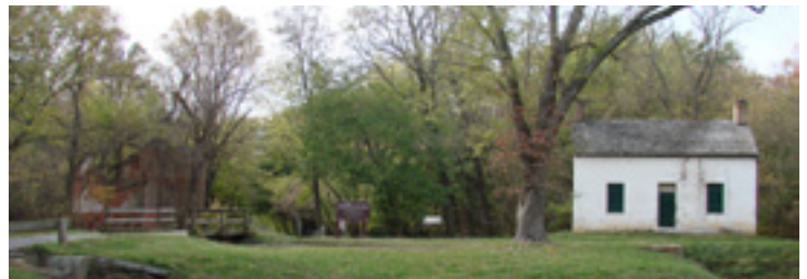
Edwards Ferry Lockhouse

A unique opportunity to enhance the heritage area’s visitor experience is now available through the Canal Quarters interpretive program. Visitors are invited to experience a taste of life along the canal by staying in a historic lockhouse for a day and night, with three lockhouses currently open. Renovation is underway at Lockhouse 25 at Edward’s Ferry and the Park Service has submitted an MHAA capital grant