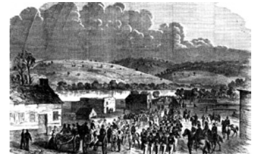
Edwards Ferry during the Civil War

Production of our upcoming video, Life in a War Zone: Montgomery County during the Civil War , is in full swing! The script has been finalized and the stories we have to tell are amazing! Did you know that cannon fire from the 1 st Battle of Bull Run in Manassas could be heard from a front porch in Bethesda? Filming will take place around the County this summer and we are working with the Washington Revels on production of the video soundtrack.