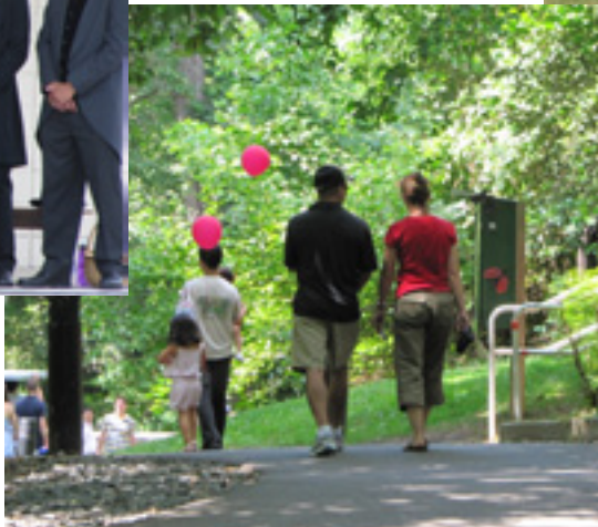
Glen Echo Park