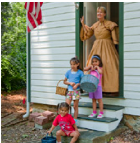
Brookeville One-Room Schoolhouse