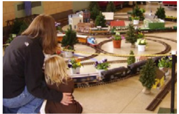
Model Train at Historic Silver Spring B&O Railroad Station