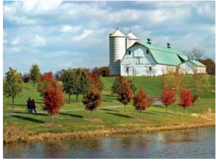
King Barn Dairy MOOseum

Warren Historic Site Committee of Dickerson received $1162 for refinishing the front doors and replacing the iron rails at the historic Warren UM Church