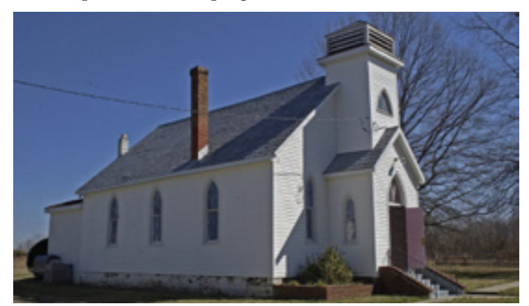
Warren United Methodist Church

Montgomery County Historical Society received $1250 to produce a new marketing brochure and purchase equipment for the Speakers Bureau program