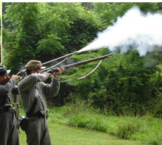
Civil War Reenactors