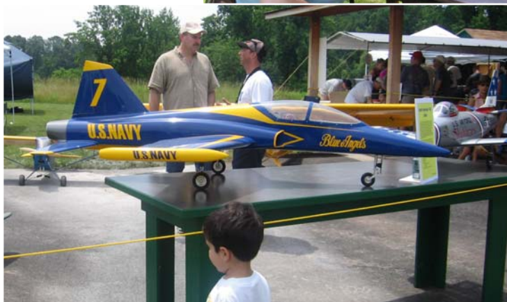
Below: Radio Control Club