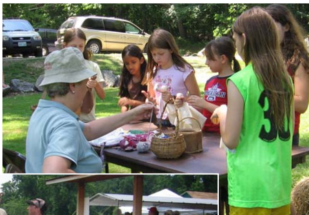
Right: Crafting at Oakley Cabin