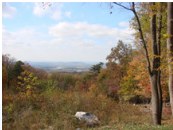
View from atop Sugarloaf Mountain