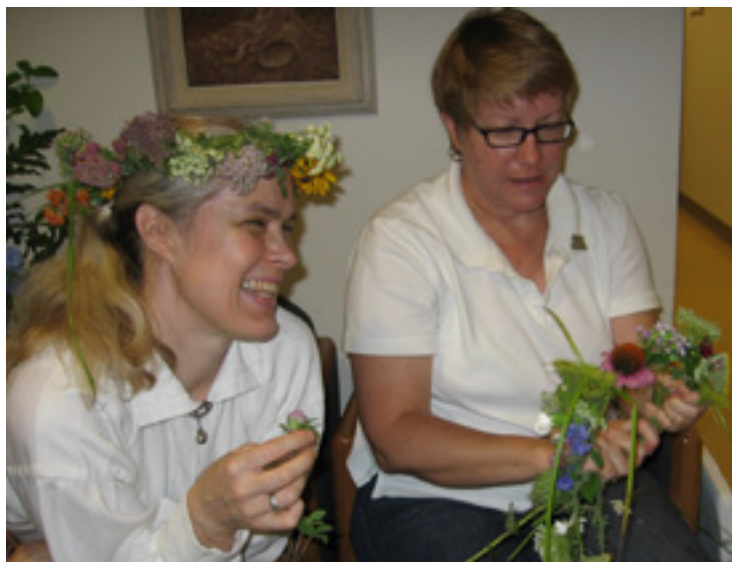
Making traditional floral wreaths at the American Latvian Museum