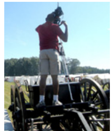
Film crew at work

For information about all of our terrific Civil War-related projects, visit the HM website!