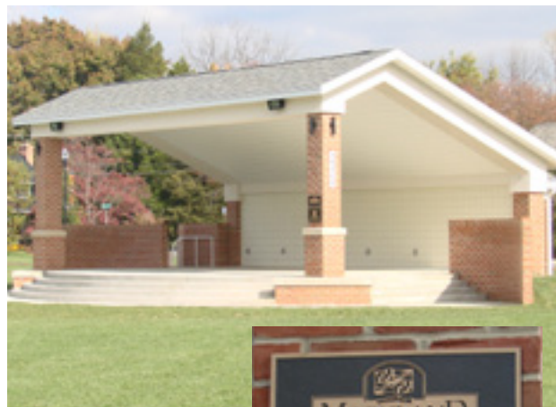
Poolesville Band Shell at Whalen Commons Park