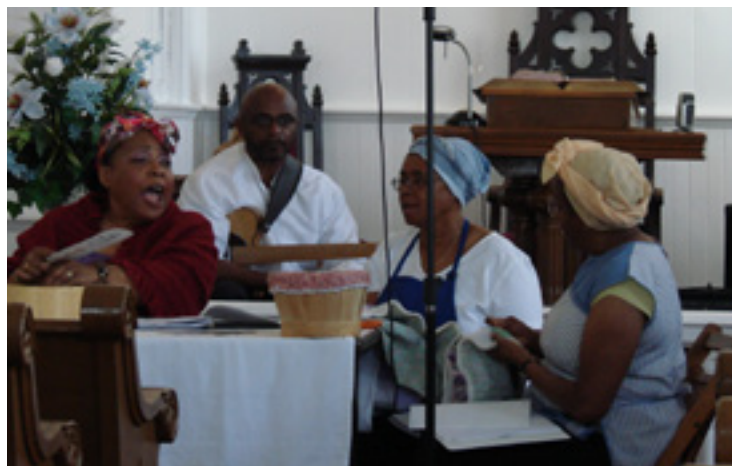
"Spiritual Harmony" at St. Paul Community Church

On June 22 Heritage Montgomery was the recipient of a Montgomery County Council Proclamation in recognition of Heritage Days Weekend and Heritage Montgomery's years of service to the residents of the county.