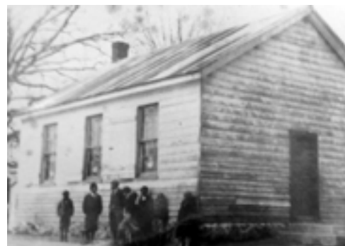
Original Schoolhouse at Pleasant View

We are very excited about this special project and look forward to premiering the film during Black History Month in February 2014.