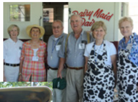
King Barn Dairy MOOseum