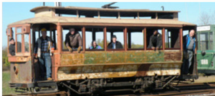
National Capital Trolley Museum

Heritage Montgomery Management Grant – $100,000