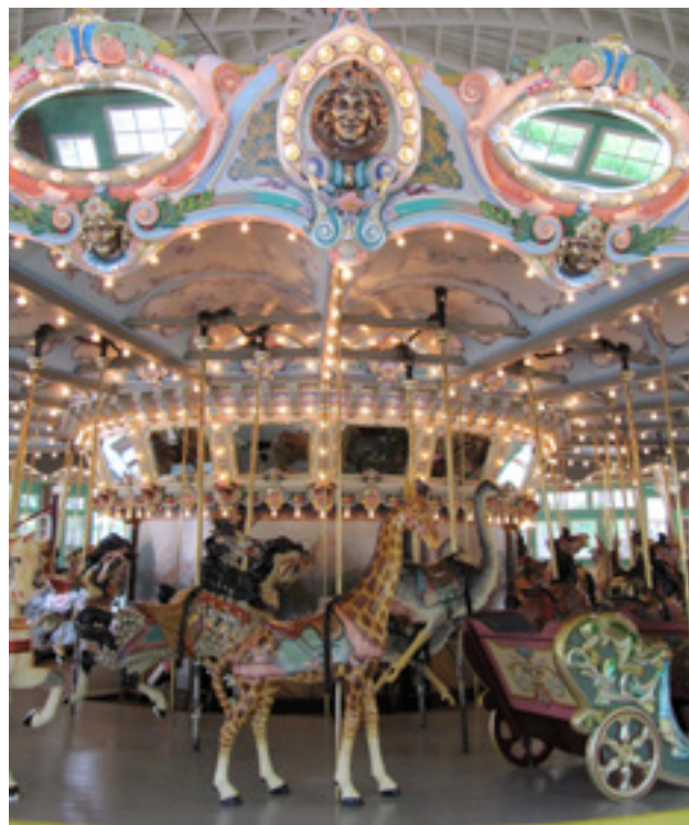
Glen Echo Carousel

To revise and reprint the Warren Historic Site brochure