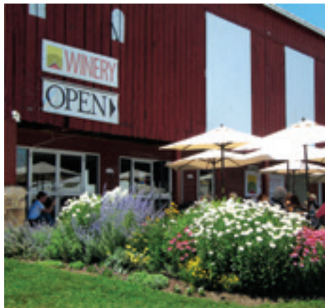
Sugarloaf Mountain Vineyard

Mark your calendar for Heritage Days Weekend – Saturday, June 28 & Sunday, June 29!