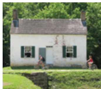
C&O Canal Lockhouse 25

host activities highlighting the town that was “U.S. Capital for a Day” during the War of 1812.