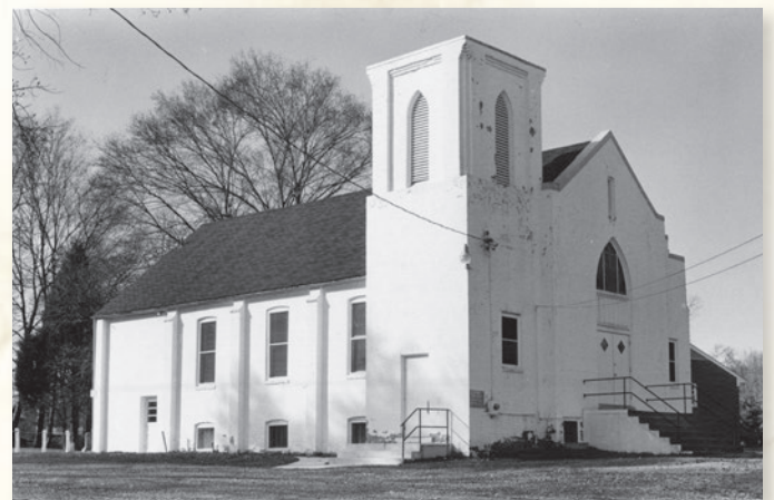
John Wesley M.E. Church in Clarksburg, 1970s.

These 1920s and 30s churches feature a central entrance under a gable roof and steeple, with Gothic arched windows, rows of pews, an organ and raised altar, and a choir loft. The sanctuary was above, with a social hall and rooms below for meetings of Methodist men, Ladies Aid Society, Sunday School, and other groups. On the grounds were cemeteries, schoolhouses, or meeting halls, and a few public open spaces. These all were put to special use during the month of May, when black communities celebrated Homecoming with reunions, picnics and parades, music and bands, and visiting at family graves. For many churches, this was the opportunity to raise funds for the coming year.