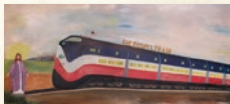
Gospel Train at Warren Church

Prior to the Civil War, masters were encouraged to instruct their slaves in Christianity, although as abolition voices rose, the State passed laws forbidding colored