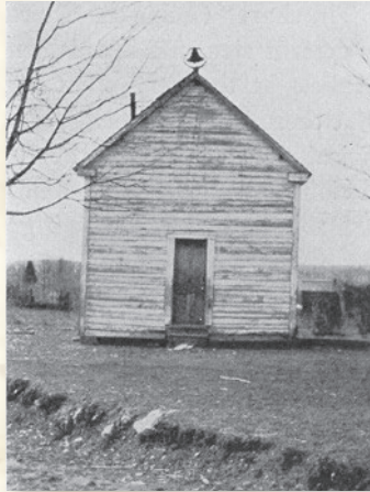
“An Humble Colored Church” pictured in 1912 study of Montgomery County by the Presbyterian Church

Benevolent societies and fraternal organizations soon emerged. Methodism was strong in Maryland, so between 1870 and 1910 more than two-thirds of all new congregations in the County were of that denomination. Hardy circuit riders rode on horseback from church to church, taking as many Sundays as there were churches on the circuit to make the rounds. A circuit, or charge, consisted of a group of churches served by the same minister. Local preachers and class leaders helped to mark the passages of life when the circuit-riding minister was absent.